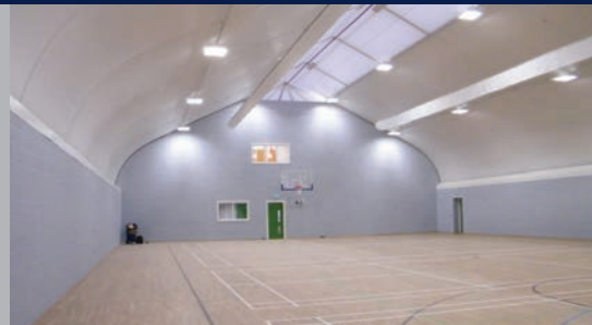
Large clearspan interiors