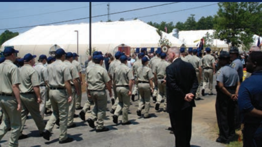
Limited foundation requirements