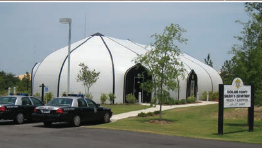
Lease or purchase