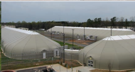
Widths 30' to 200' by any length