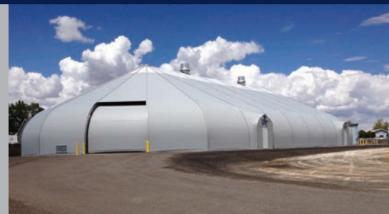
Large assortment of cargo door options