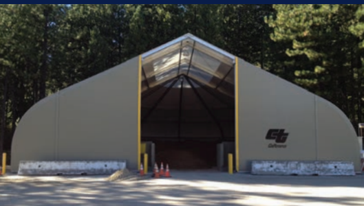
Lease or purchase