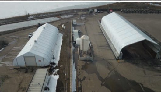
Widths 30' to 200' by any length

Maintenance free, highly tensioned exterior membrane. Does not have to be re-tensioned for the life of the building.