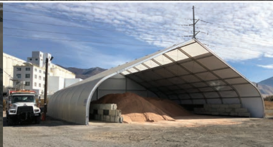
Sand and salt storage