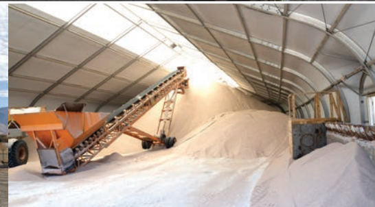
Large clearspan interiors