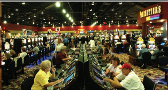
Large clearspan interiors