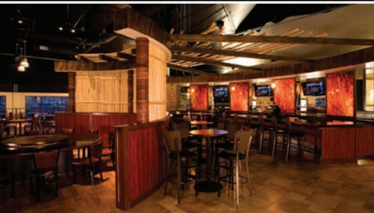
Food and beverage facilities