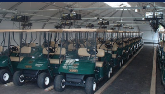
Lease or purchase