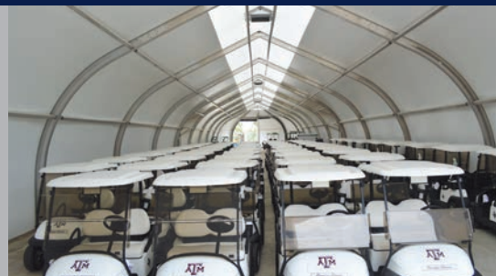
Daylight panel in peak allows natural light