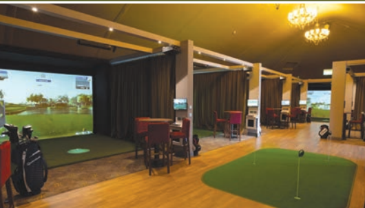
Golf simulation facilities