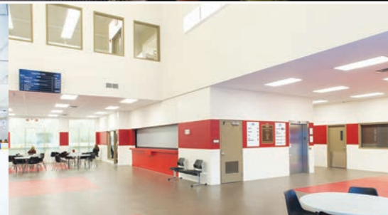
Second floor viewing level