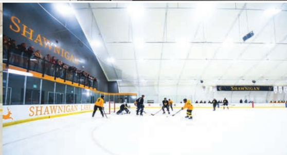
Tall peak height