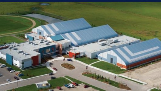
Exterior color options