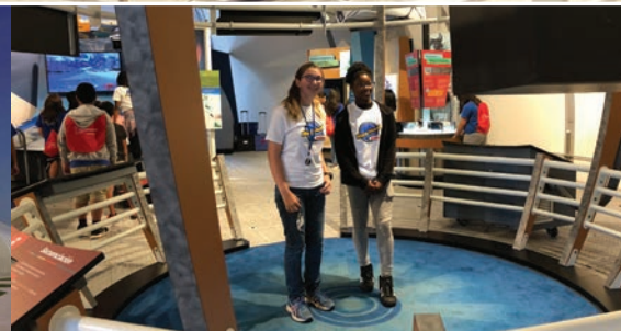
Large clearspan interiors