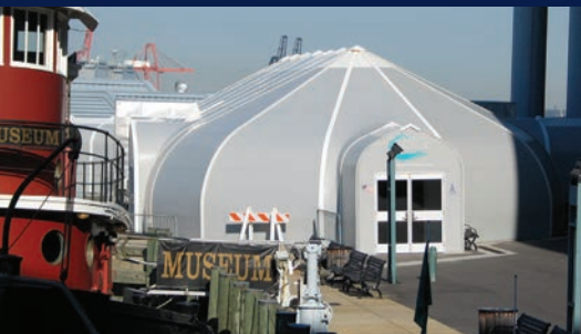
Large assortment of window and door options