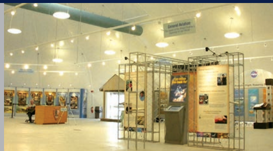
Widths 30' to 200' by any length