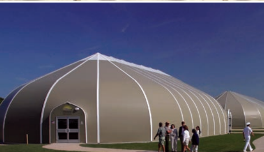
Capable of hanging lighting and sound fixtures