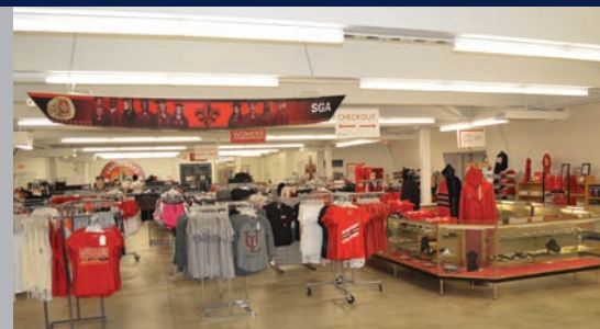
Immediate delivery from inventory