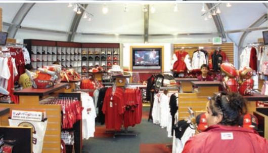
Large clearspan interiors