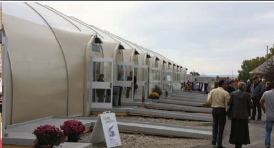
Lease or purchase