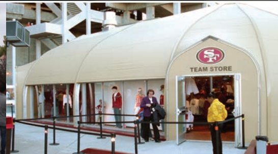
Widths 30' to 200' by any length