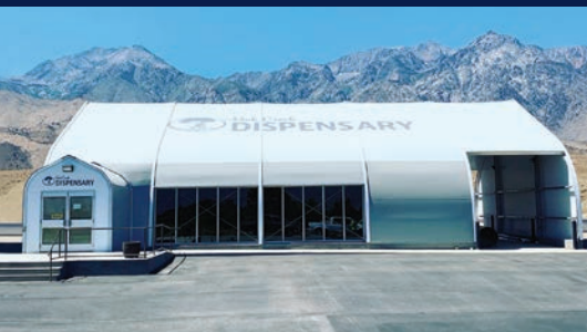
Window, doors and glazing wall options