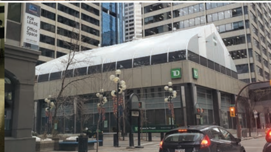
Widths 30' to 200' by any length