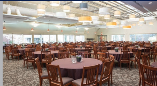
Large clearspan interiors