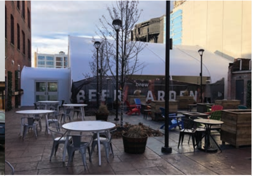
Worcester Beer Garden on the Grid 60' wide x 60' long

Sprung mobilized and supplied a 60' x 60' structure within 3 weeks that includes natural daylight panels in the peak and large translucent garage doors in the flat ends. The clear span interior space provided by Sprung was ideal to incorporate a modular kitchen trailer as well as sports bar amenities typically found in convention construction.