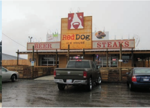
Red Dog Ice House Carrizo Springs, Texas 60' wide x 60' long

Located on 315 beautiful acres in the heart of Temecula wine country in California, Mount Palomar Winery has been proudly growing and producing award-winning wines since 1969. This 40' wide by 60' long fully insulated structure with Class A Roof will be used for wine tasting, banquet and exhibition space. Sprung Structures engineered tension membrane technology is designed for year round applications and provides significant advantages over other building systems, including upgraded aesthetics, energy efficient insulation and glazing walls.