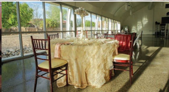
Window, doors and glazing wall options