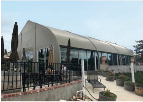
Mount Palomar Winery Temecula Wine Country, California 40' wide x 60' long

A Faster Way to Build Engineered & Manufactured by Sprung Instant Structures