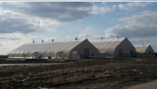
Remote processing facilities