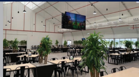
Safety meeting and break rooms