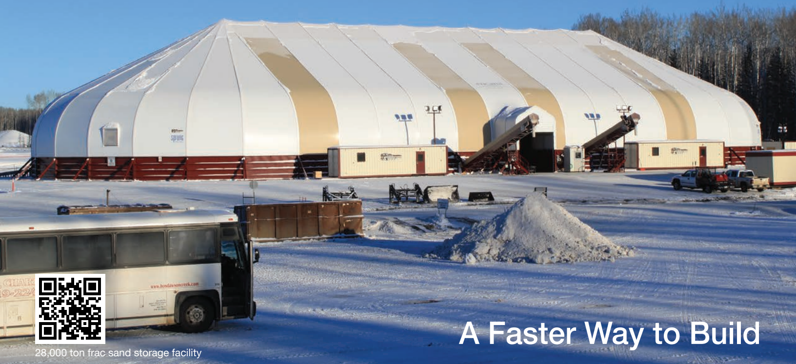
28,000 ton frac sand storage facility