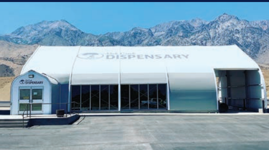
Window, doors and glazing wall options