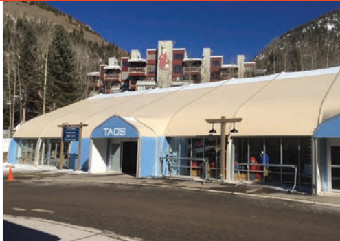
TAOS SKI LODGE

Taos Ski Lodge, NM Retail Facility 70' wide x 150' long