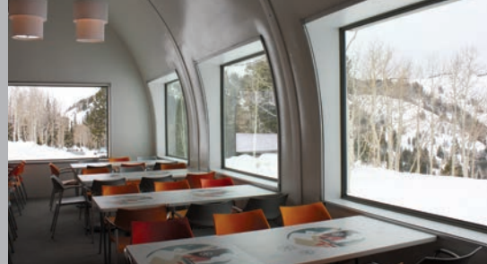
Optional integrated daylight panels, high-performance insulation packages, glazing walls and more.