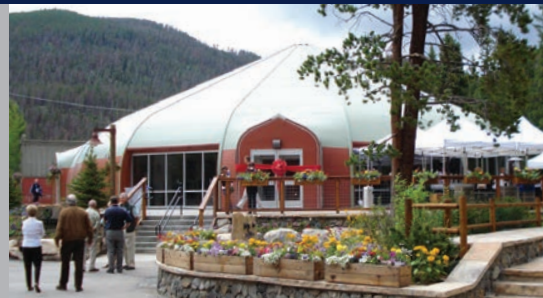
Glazing walls, door and window options