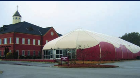
Experience the "Wow Factor"