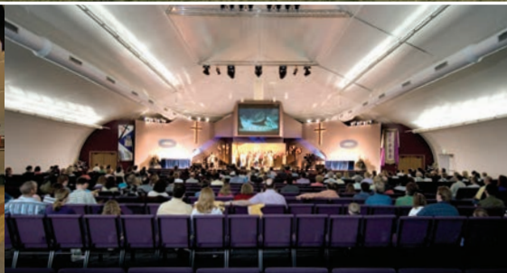
Large clearspan worship space