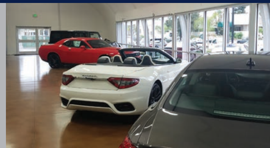
Optional glazing walls