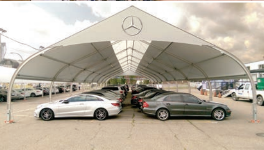
Dealership hail and sun shelters