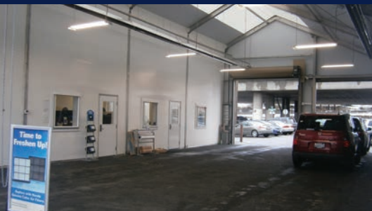
Drive-through service bay