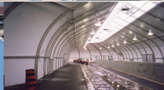
Daylight panels in peak create bright interiors