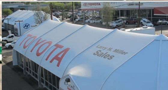
Optional large branding graphics