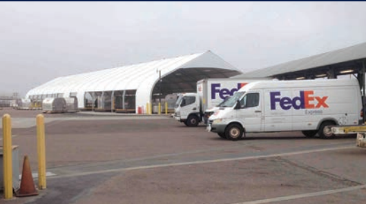
Cargo sort facilities