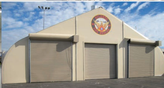
Ground support equipment