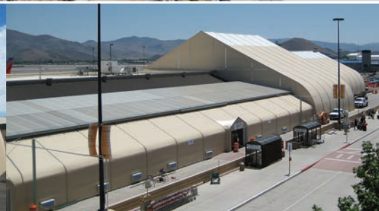
Passenger corridors and terminal expansion