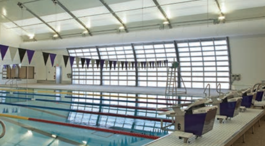
Daylight panels add natural light