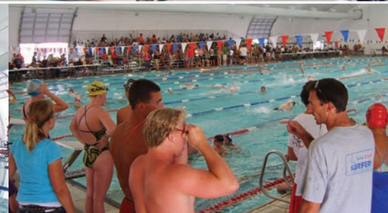
Immediate delivery from inventory