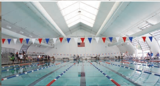
Bright spacious clearspan interiors