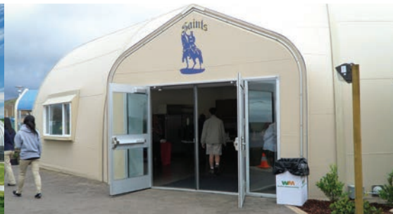
Complementary hood graphics