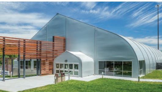
Lease or purchase