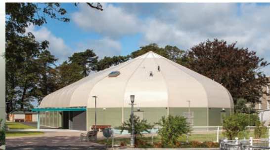
Widths 30' to 200' by any length