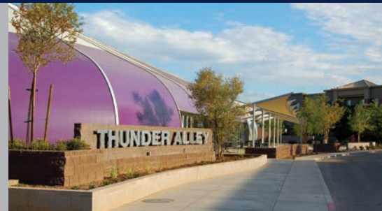
Exterior color options