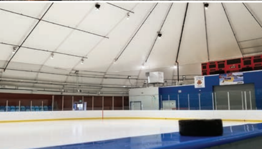
Ice Arenas Field Houses