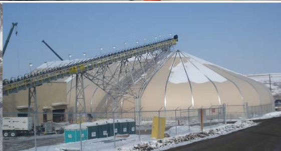
Storage and warehousing