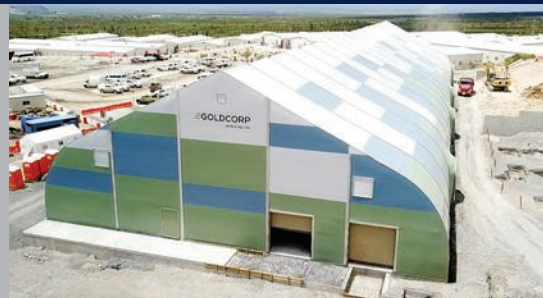
Break and safety meeting rooms