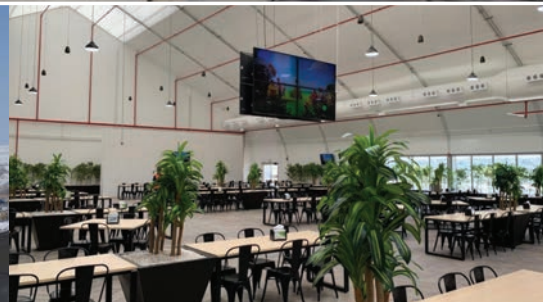
Large clearspan interiors