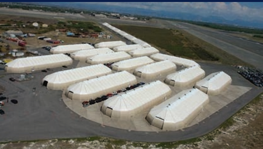
Insulated and uninsulated warehousing