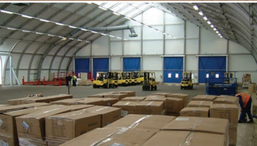
Widths 30' to 200' by any length