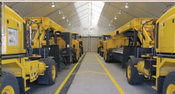
Large clearspan interiors