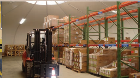
Lease or purchase