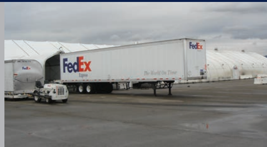
Available immediately from inventory