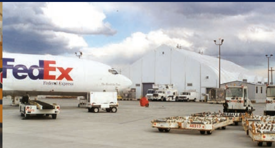
Logistics and Distribution Facilities