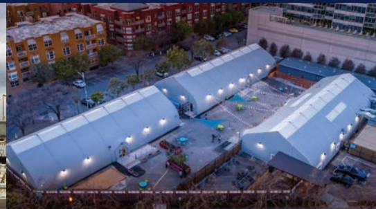
Dormitory style housing