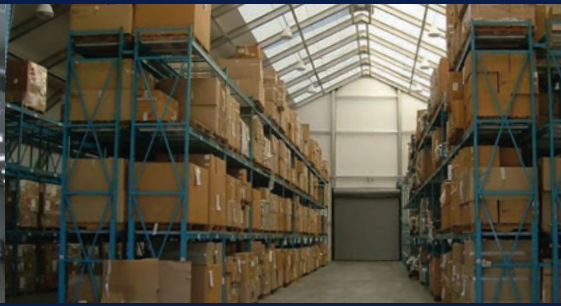
Warehousing for asset protection