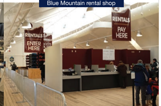
Blue Mountain rental shop

With the immediate positive impact of the tube park day lodge, Blue mountain began phase two of their expansion and moved several of their service areas to the base of the mountain. The facility uses two connecting corridors to attach three Sprung structures to their existing facilities. The complex is called Frontier Center and houses a rental shop, ticketing, child care, snack bar, and a locker area.