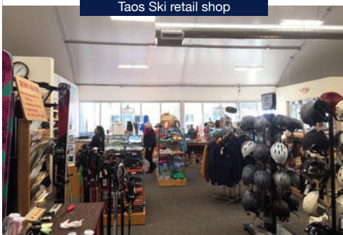
Taos Ski retail shop

The center houses the Visitor's Center, the Taos Ski Valley Chamber of Commerce offices, Ski and Boot Doctor, Seasonal Lockers, Andean Software and rental shop.