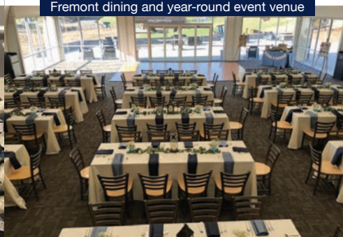
Fremont dining and year-round event venue

In just four weeks, the 4,500 sq. ft. Fremont Sprung structure was erected in a secluded ski-in, ski-out location. This new space was built to accommodate 150 people for dinner service and 200 for cocktail receptions. Large windows provide plenty of natural daylight and celebrate the stunning landscape. A 19'2" connector bridges to a kitchen trailer, and the insulated structure supports everything needed for comfortable year-round dining and events.