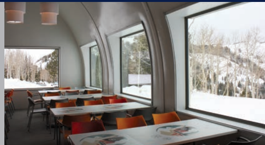
Optional integrated daylight panels, high-performance insulation packages, glazing walls and more.