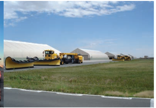
Denver International Airport Denver, Colorado Five - 70' wide x 180' long

When Arizona's Mesa Gateway Airport was about to undergo renovations to its terminal, airport officials identified the need for a safe, temporary enclosure where passengers could walk from security and then gather in a concourse prior to boarding their flight. After exploring several modular options, including trailers and other fabric buildings, officials concluded that Sprung would deliver the fastest, most comfortable and aesthetically pleasing solution. Sprung provided both the connecting corridor and the concourse structure, the latter of which offers ample space and natural light for passengers, thanks to its large windows and daylight panels. Although this was originally meant to be a temporary project, Mesa Gateway Airport ended up purchasing the structure, and there are plans to repurpose it once the conventional construction of the terminal is completed.