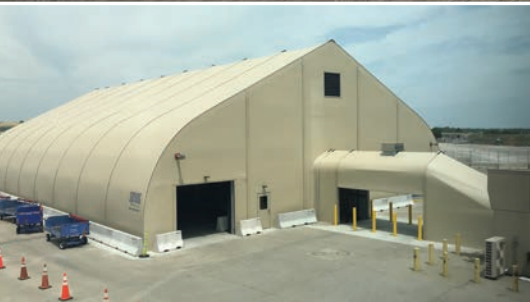
Baggage screening structures