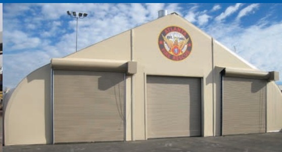
Emergency equipment storage