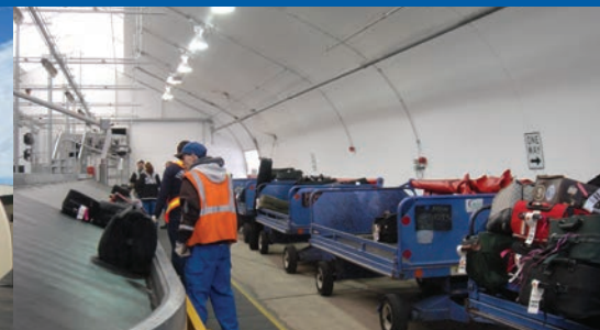
Baggage handling buildings