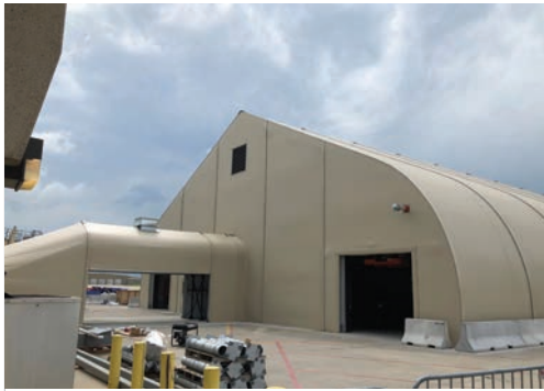
Southwest Airline (SWA) Kansas City International Airport (MCI) Kansas City, Missouri 90' wide x 130' long

Engineered & Manufactured by Sprung Structures