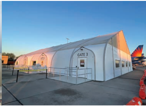
Mesa Gateway Airport Mesa, Arizona 60' wide x 105' long 14'3" wide x 190' long (connecting corridor)

While Kansas City International Airport underwent a series of major renovations, Southwest Airlines needed an interim baggage handling facility on-site. Having collaborated with Sprung on a number of projects in the past, executives at Southwest chose Sprung to provide them with a fast, flexible and cost-effective solution. Sprung designed and delivered a fully insulated baggage facility building, which came complete with a conveyor system that extended from the airport's conventional terminal building into the temporary structure. Not only did this conveyor need to be covered, it also had to cross a traffic lane used by baggage tugs. To ensure baggage would flow without issue, Sprung engineered a large opening to allow for tug traffic to run underneath the protected conveyor.