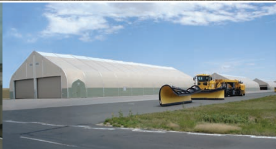
Snow removal equipment storage