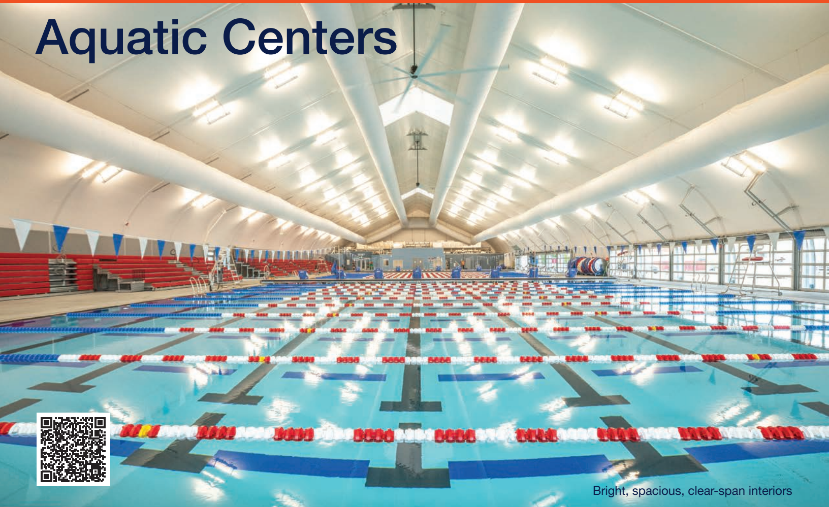
Bright, spacious, clear-span interiors