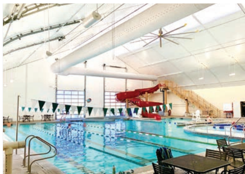
Philip S. Miller Park Town of Castle Rock, Colorado 110' wide x 105' long

Engineered & Manufactured by Sprung Structures