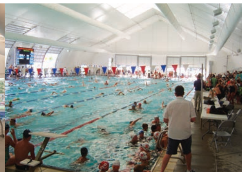
Kearns Oquirrh Park Fitness Center Kearns, Utah 120' wide x 195' long

Today, the Idaho Central Aquatic Center (ICAC) is considered one of the largest competitive indoor pool facilities in the western United States. Featuring daylight panels, a custom glazing wall and an attractive mosaic pattern on its membrane, the ICAC encompasses two state-of-the-art Myrtha Pools and seating to accommodate over 1,000 spectators.