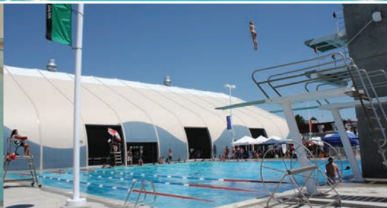
Rust-free aluminum substructure