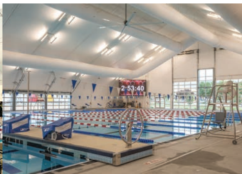
Idaho Central Aquatic Center Boise, Idaho 120' wide x 315' long

Sprung designed and delivered a bright, energy-efficient, low-maintenance structure where residents can swim year-round. Now part of the town's 64,000-square-foot Miller Activity Complex, the fully insulated enclosure encompasses two waterslides, four lap lanes and a vortex pool. It also features translucent doors and daylight panels for optimal natural light.