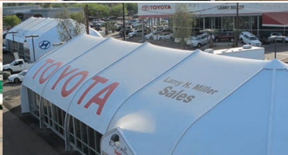
Optional large branding graphics