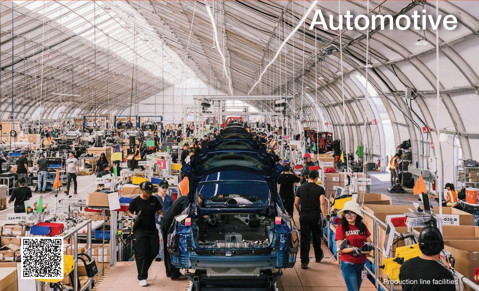
Production line facilities