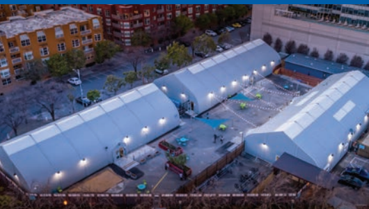
Dormitory style housing