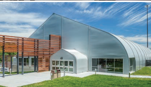
Lease or purchase