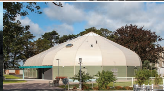
Widths 30' to 200' by any length