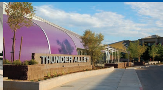
Exterior color options