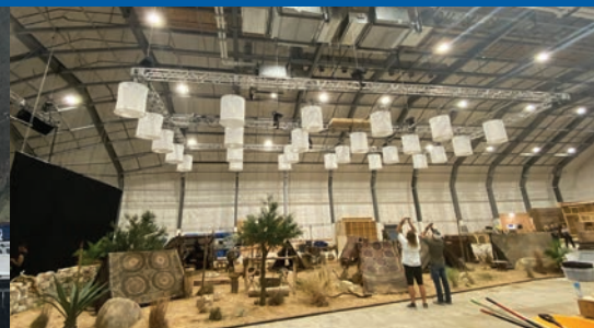
Customized lighting grid