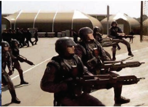
Starship Troopers Multiple locations Multiple structures

The Sprung structure was assembled and crane-lifted into place over two existing homes in the City of White Rock (part of Metro Vancouver). An additional opaque black interior membrane was added to enhance the nighttime filming environment. Sprung's short-term lease program ensured a cost-effective solution for capturing the important scenes of the movie.