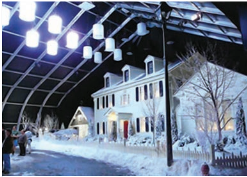
Deck the Halls Vancouver, British Columbia 130' wide x 260' long (peak height 48 feet)

Build Faster Engineered & Manufactured by Sprung Structures