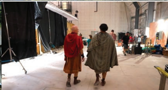
Wardrobe & makeup area