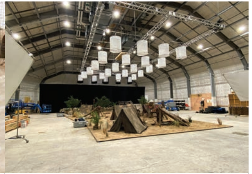
The Chosen Midlothian, Texas Two - 120' wide x 270' long One - 70' wide x 135' long One - 70' wide x 90' long

Producers also leased several Sprung structures to house various departments; special effects, wardrobe, props, craft services, set construction and the grid department all had their own structures on-site, which led to enormous cost savings on the production. The Sprung structures were also easily dismantled and relocated to other locations throughout the shoot.