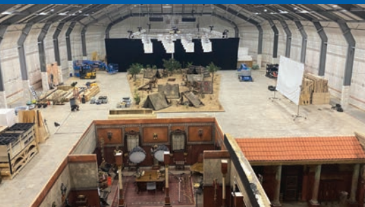
Large clearspan space