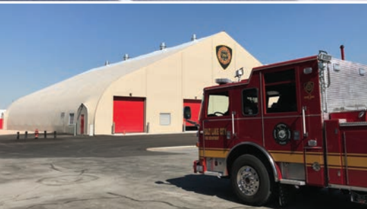
Available immediately from inventory