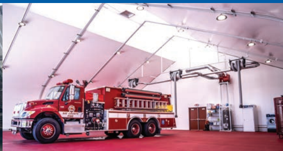
Optional, highly efficient insulation system