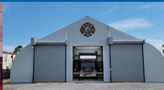
Rolling service doors