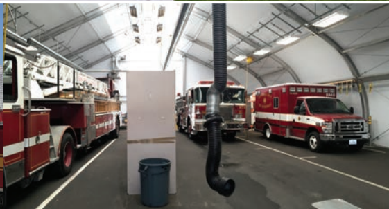
Large, clear-span interiors