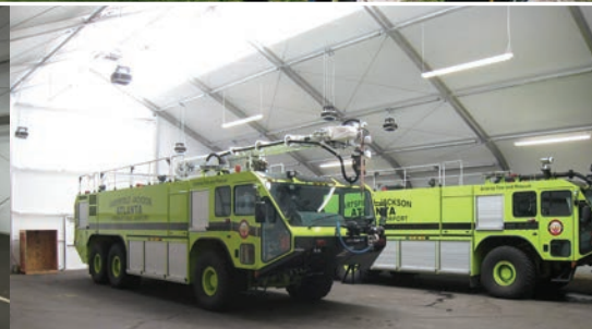
Daylight panels for optimal light