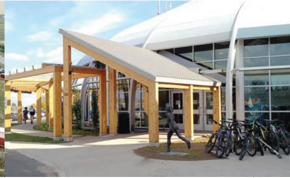
Martensville Athletic Pavilion Martensville, Saskatchewan, 140' wide x 290' long

Within a few short months, a fully insulated Sprung structure was erected to accommodate a wide range of needs and applications. The structure features a 12,000-square-foot gymnasium, weight room, running track and change rooms, as well as administration space, centers for both Elders and youth, a nutrition center and an Indigenous library.