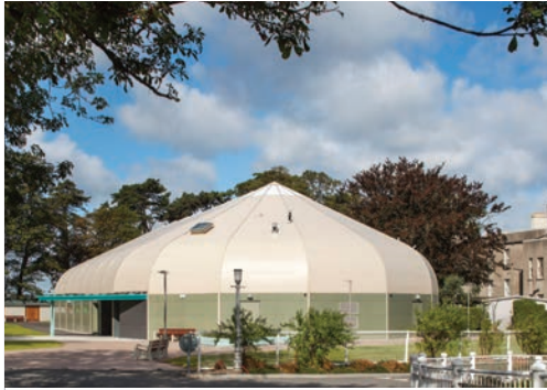
Blackrock College Dublin, Ireland 80' wide x 185' long

Engineered & Manufactured by Sprung Structures