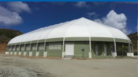
Community sports facilities