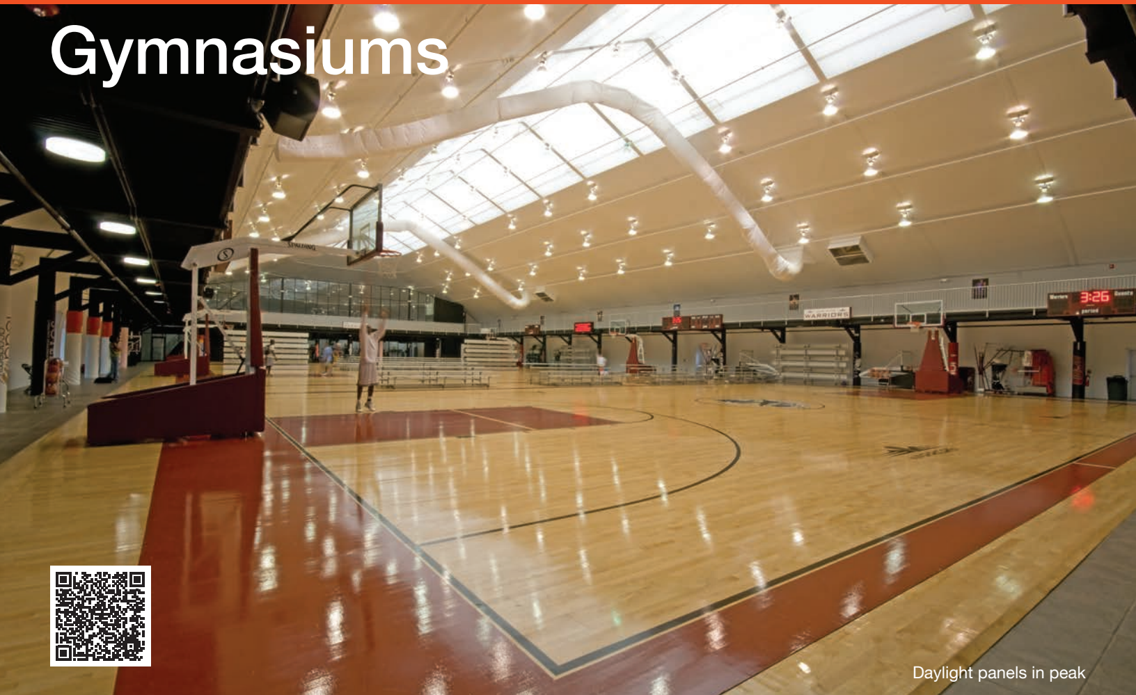
Daylight panels in peak