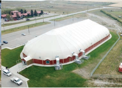
Kainai Nation (Blood Tribe) Southern Alberta 130' wide x 290' long

Sprung designed and delivered a fully insulated, 80' x 185' structure, which was erected in a fraction of the time of a conventional gymnasium, and at a much lower cost. Known as the Des Places Sports Hall, the innovative structure features a hard-wall Sprung Shield that runs down the interior and exterior walls to cover ducting while providing a protective rebound surface. The building also features a self-supporting canopy over the main entrance, as well as daylight panels in the peak, which optimize natural light in order to enhance the playing environment.