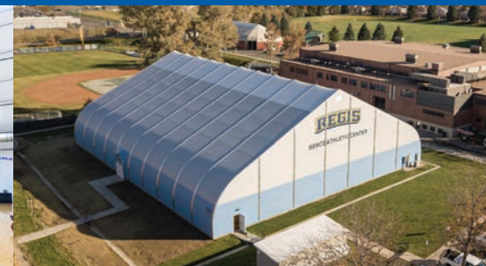
Expand education sports programs