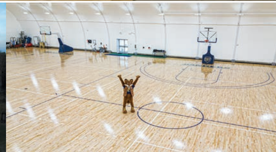
Large, clear-span interiors