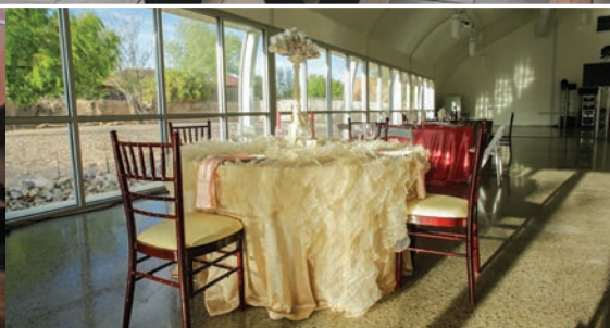
Window, door and glazing wall options