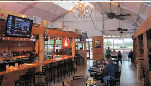
Widths 30' to 200' by any length