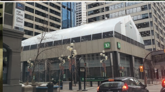
Limited foundation requirements