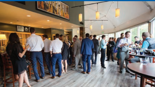
Immediate delivery from inventory