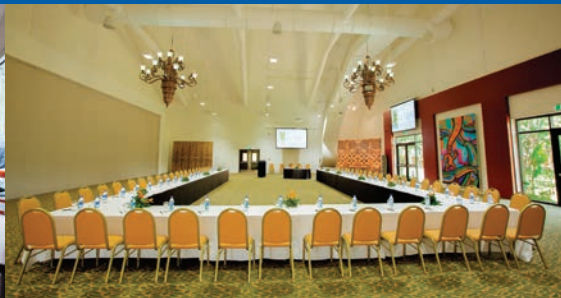
Optional, highly efficient insulation system