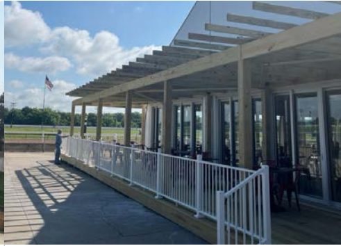
Longshots Collinsville, Illinois 60' wide x 60' long

Sprung designed and delivered a fully insulated, 40' x 60' structure with a Class A roof, ensuring customers and staff would remain sheltered from the elements during tastings and functions. The structure also features attractive glazing walls, which allow for lovely views of the winery and ample natural light throughout the building.