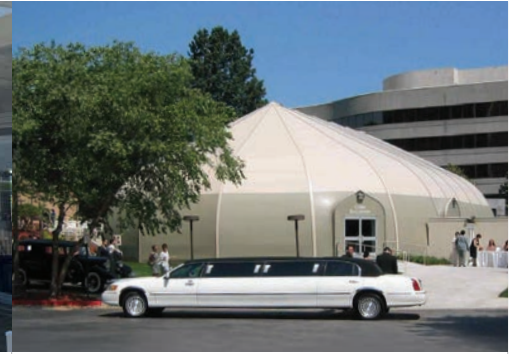
Marriott Atlanta, Cobb Ballroom Atlanta, Georgia 70' wide x 120' long

Constructed in just 23 days (two days ahead of schedule), Fairmount Park's new restaurant and bar facility, known as Longshots, is fully insulated and features a spacious, clear-span interior, glazing walls for optimal racetrack views, and an attached, outdoor deck that allows patrons to get even closer to the action.