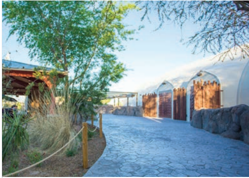
El Paso Zoo El Paso, Texas 60' wide x 90' long

Build Faster Engineered & Manufactured by Sprung Structures