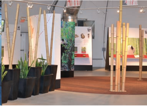
Toronto Zoo Toronto, Ontario 60' wide x 147' long

Sprung delivered a bright, clear-span structure that took just four months to complete. The building includes a Dupont Tedlar architectural membrane, R-28 fiberglass blanket insulation and two glazing walls to optimize natural light. To complement the rest of the zoo environment, custom wooden doors and cladding were added to the exterior of the structure, while an attractive vestibule encloses and hides the exterior HVAC system.