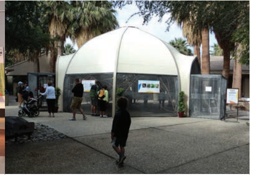
The Living Desert Zoo Palm Desert, California 30' wide x 30' long

The adaptability of the Sprung structure makes it especially well-suited for zoos, offering long-term value through its ability to be easily reconfigured and relocated for a variety of uses.