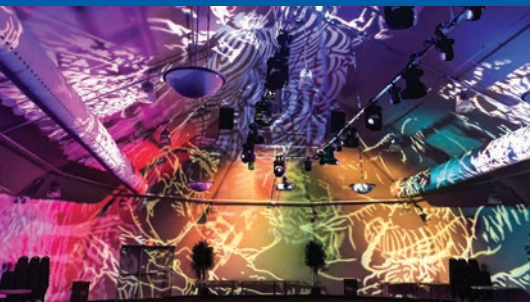
Year-round event venue