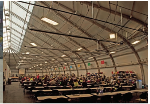
Skanska/Intel Arizona and Oregon 120' wide x 270' long

Sprung supplied a 100' x 470' structure that includes a nine-inch-thick layer of formaldehyde-free fiberglass blanket insulation, a full-height interior partition and three 16' x 16' rolling service doors. The facility, which houses a full-scale machine shop, crane and storage racking, and a calibration room, also features a low-temperature arctic membrane, designed exclusively for cold-weather applications.