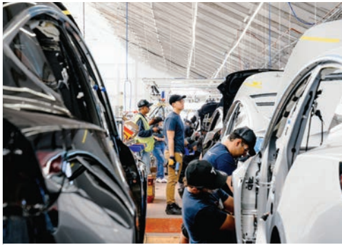
Tesla Inc. Fremont, California 150' wide x 915' long

Engineered & Manufactured by Sprung Structures