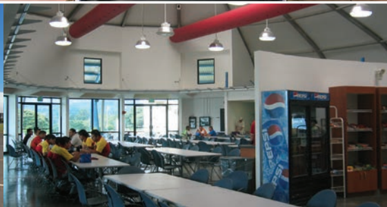
Dining/food services facilities